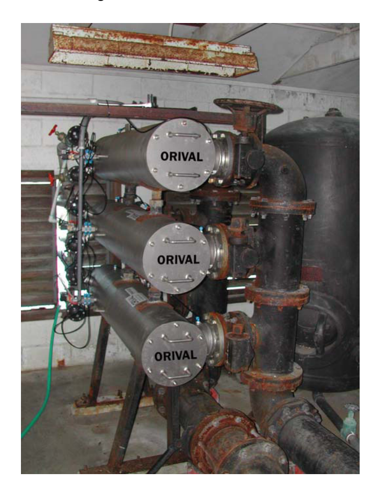
Figure 2. Three High Performance Stainless Steel Filters

A dependable long term solution was found using three filters with weave-wire 316L stainless steel screens as positive barriers to organic and inorganic suspended solids. The manufacturer offered a complete line of automatic self-cleaning filters with the capability of fabricating manifolds and filter connections to fit right into the existing piping system. To prevent future corrosion problems, filters with stainless steel bodies were selected off the shelf. The Links at Bodega Harbour needed immediate action so three all stainless steel filters with high-performance multi-layer screens were shipped the day after they were ordered. Actual installation and start-up took only a day resulting in the system shown in Figure 2.