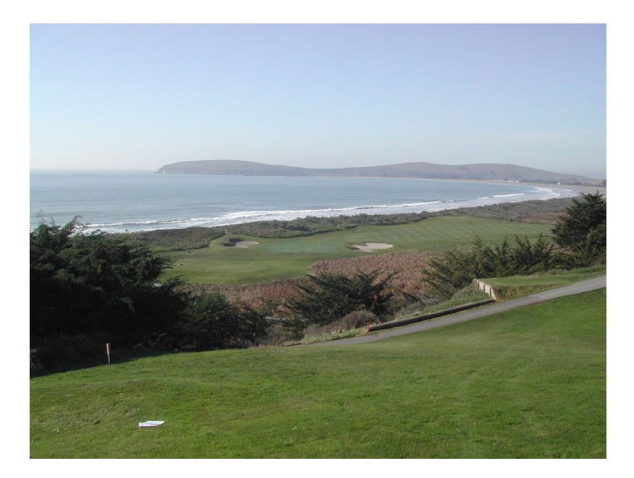
Figure 1. The Links at Bodega Harbour