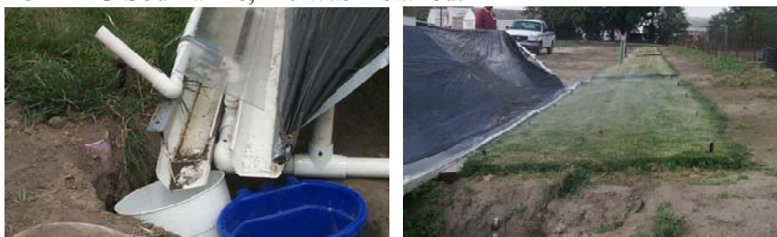
Figure 1. Left photo shows runoff collection system for surface runoff and wind drift. Right photo shows 5 by 20 foot plots and wind drift collection barrier.

hour. The lower row of sprinkler heads was installed approximately 4 inches up the slope from the lower edge of the turf. Sprinklers at each corner of the rectangular plots had 90 ^{\circ} arc nozzles, and 3 sprinklers at 5 foot intervals along the 20 foot side had 180 ^{\circ} arc nozzles. A-G Elite sod from A-G Sod Farms, Inc was installed.