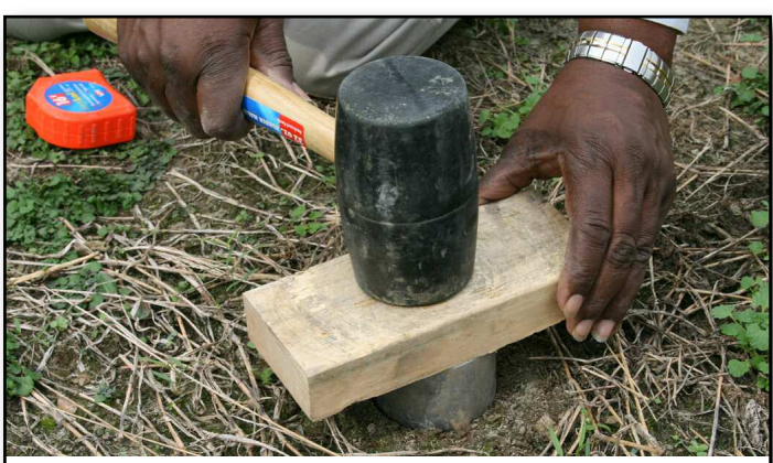
A three inch diameter ring is hammered into the soil to collect bulk density samples.

Dynamic - Bulk density is changed by crop and land management practices that affect soil cover, organic matter, soil structure, and/or porosity. Plant and residue cover protects soil from the harmful effects of raindrops and soil erosion. Cultivation destroys soil organic matter and weakens the natural stability of soil aggregates making them susceptible to damage caused by water and wind. When eroded soil particles fill pore space, porosity is reduced and bulk density increases. Cultivation can result in compacted soil layers with increased bulk density, most